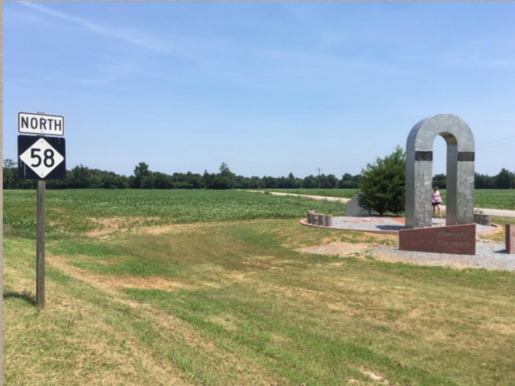
Fort Neoheroka-Off Highway 58 outside Snow Hill